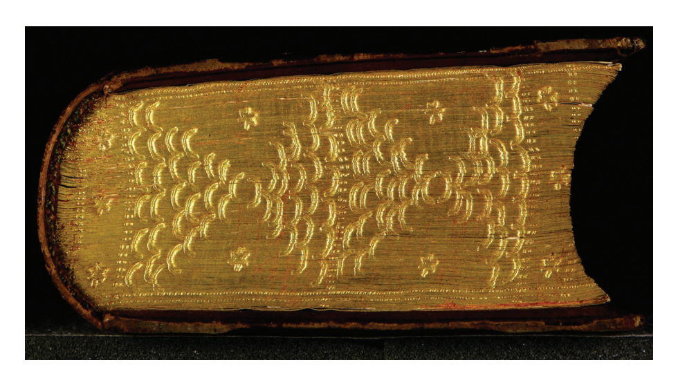
Fig. 1: Tail edge of Niels Hemmingsen, Postilla seu Enarratio Evangeliorum [...]. Hafniæ: apud Christophorum Barth, 1561. Det Kongelige Bibliotek, LN 870 8° copy 1.