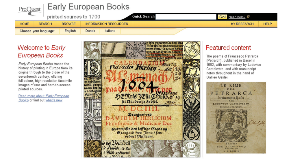
Fig. 2: Home page of Early European Books, http://eeb.chadwyck.com.