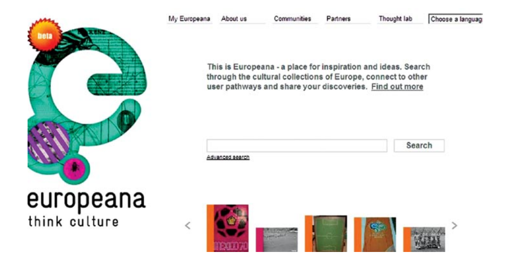
Fig. 1: Europeana.eu.