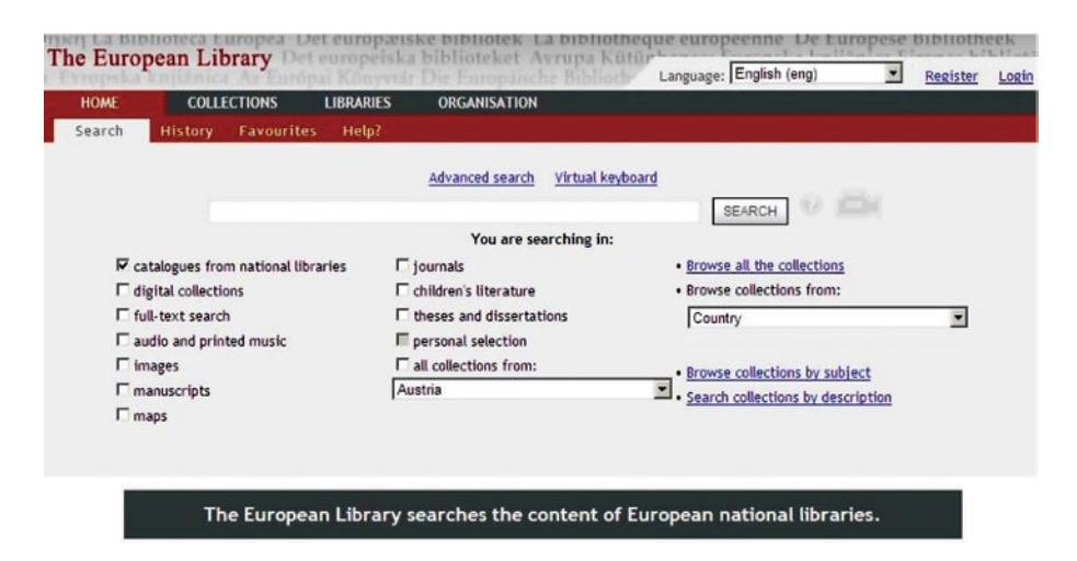
Fig. 2: The European Library.

The European Library was launched as an operational service in March 2005. It both aggregates the digital collections of Europe's national libraries and brings together the catalogues of its partner libraries to create a union catalogue for Europe. Since Spring 2010, The European Library has taken on a new role as the aggregator of digital content from national libraries for Europeana, providing monthly deliveries of digital content from national libraries to Europeana.