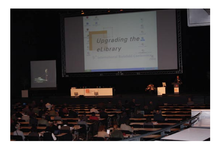
Fig. 4: Almost 400 information specialists from 30 countries attended the 9th International Bielefeld Conference.

The last talk of this conference was given by Mario Campolargo of the European Commission. His presentation, 'Europe Shaping 2020's Science: e-Infrastructures for Scientific Data' focused on the strategic role of infrastructures in transforming the information-based society into a knowledge-based society. In the particular case of scientific data e-infrastructure, the objective is to develop an ecosystem of European digital repositories, federating and adding value to national and discipline-based repositories and to respond in