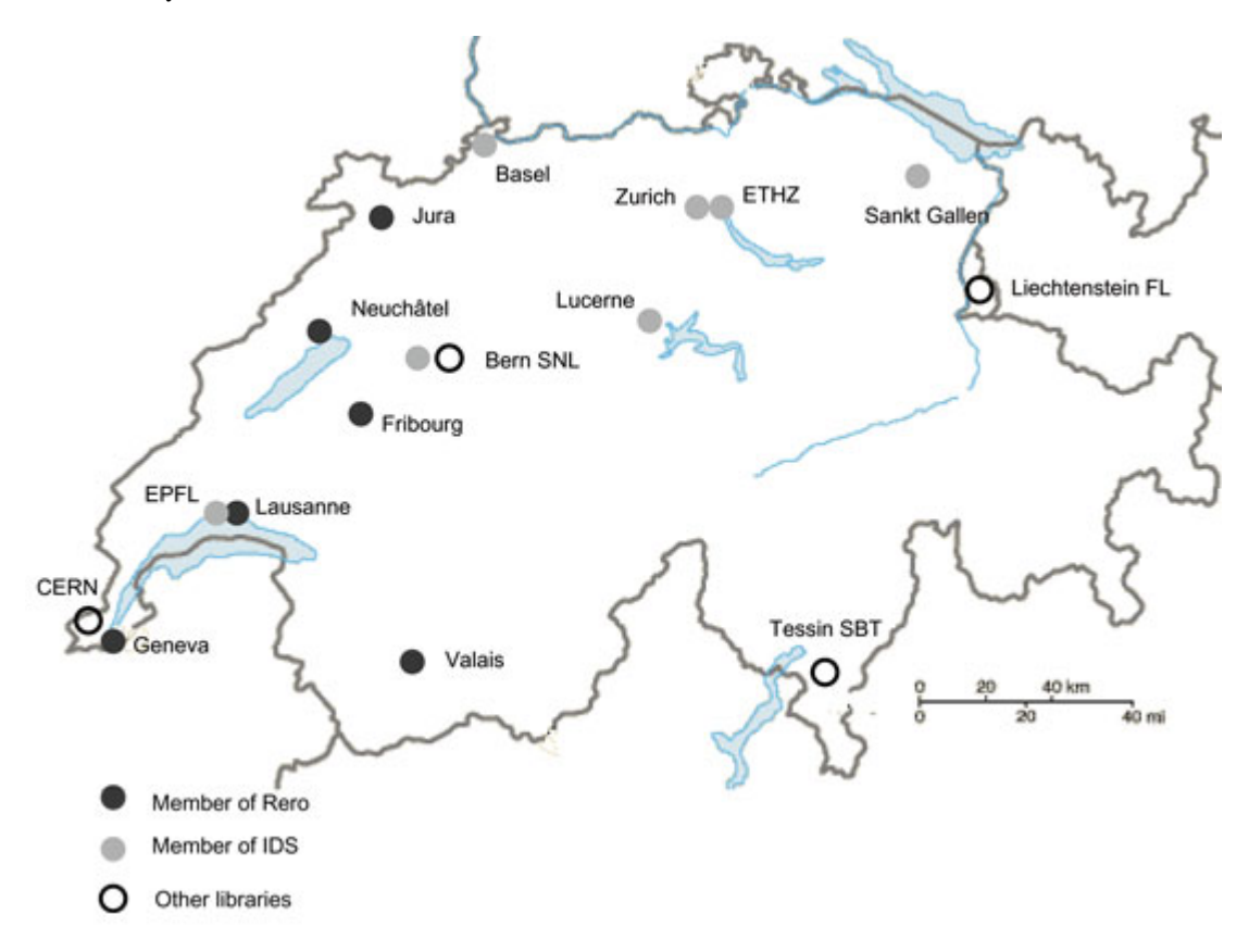
BibliOpass network, Main Libraries

Recognising this success, other libraries and networks asked to join: the Geneva University library network, the Sbt (Sistema bibiotecario ticinese) with 60 libraries from the Italian-speaking part of Switzerland, the Liechtenstein National Library, the CERN library in Geneva etc.