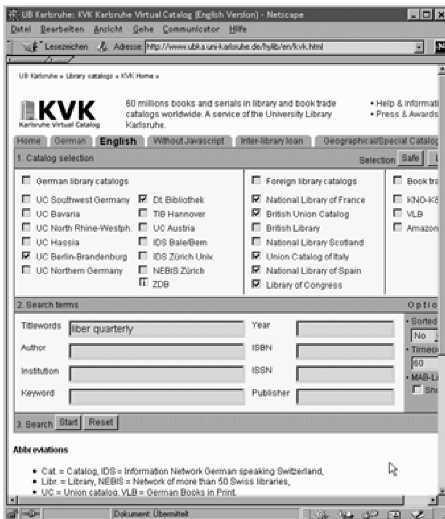
Fig. 1: KVK user interface